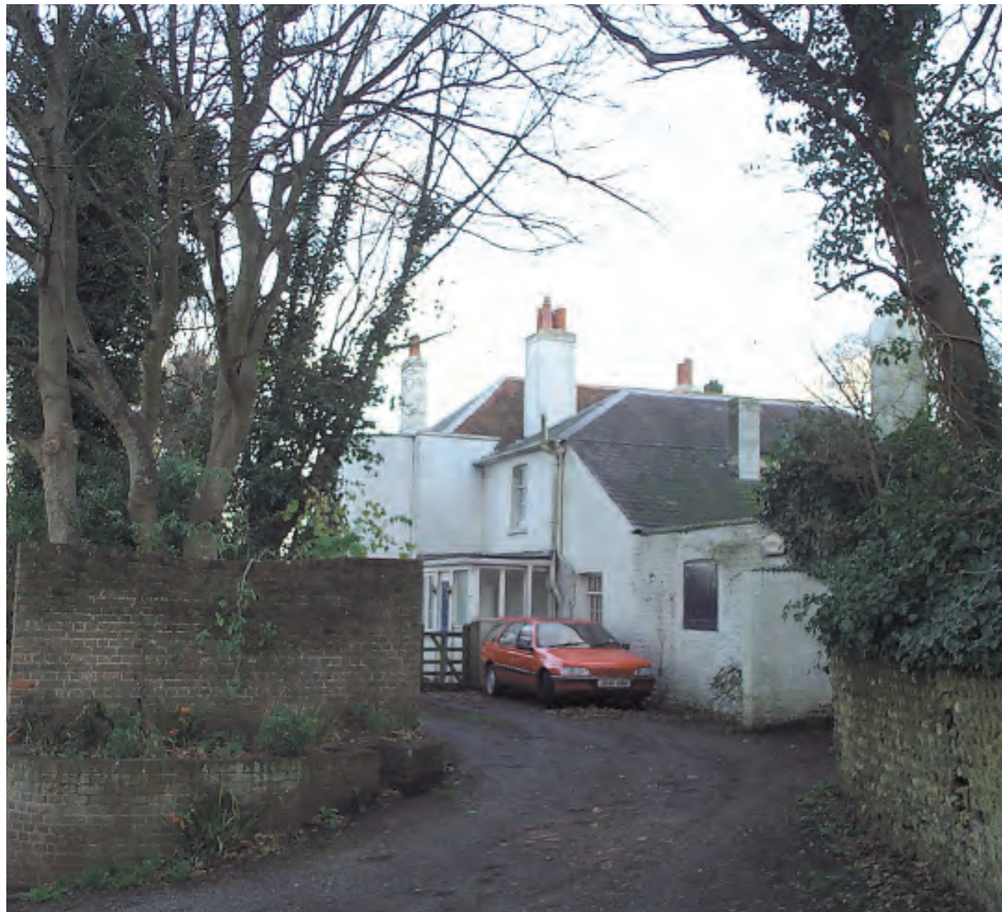
Old Rectory and St Michael's